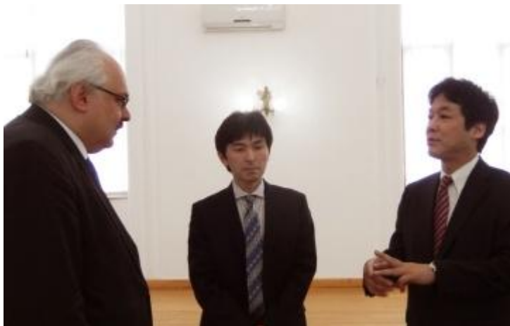
Exchanging views with Deputy Foreign Minister Mr. Jalagania